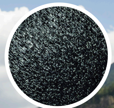
Lower Surface: Thermofusible film